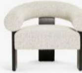
Celeste Accent Chair