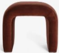
Tate Stool →

Layer in plenty of textures like boucle or velvet to add richness and depth to the energy and brightness of primary colors.